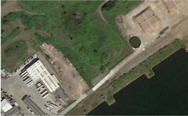
Parcel 4 Map - Land at Windward Terminal